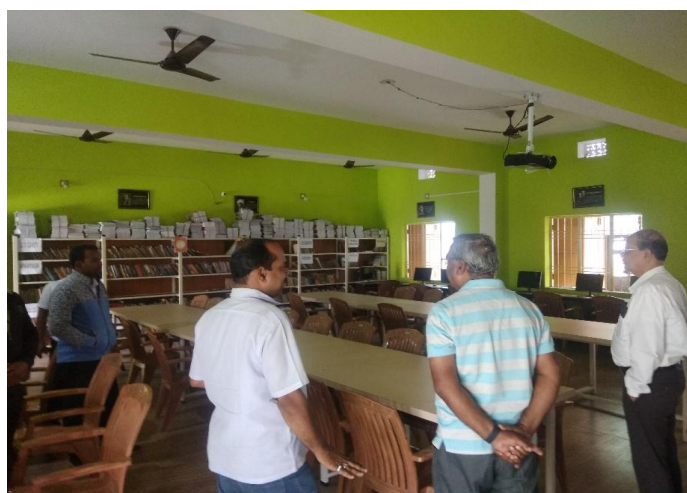
(Remuna High School Library constructed with the support from SEEDS)