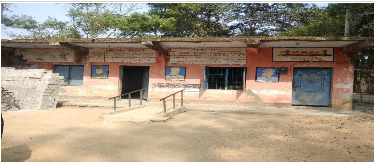
(Adivasi Girls School, Mukhura)