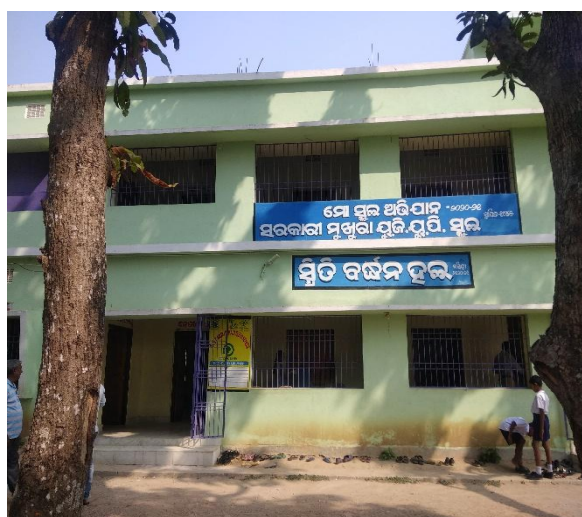
(Mukhura UG & UP School)