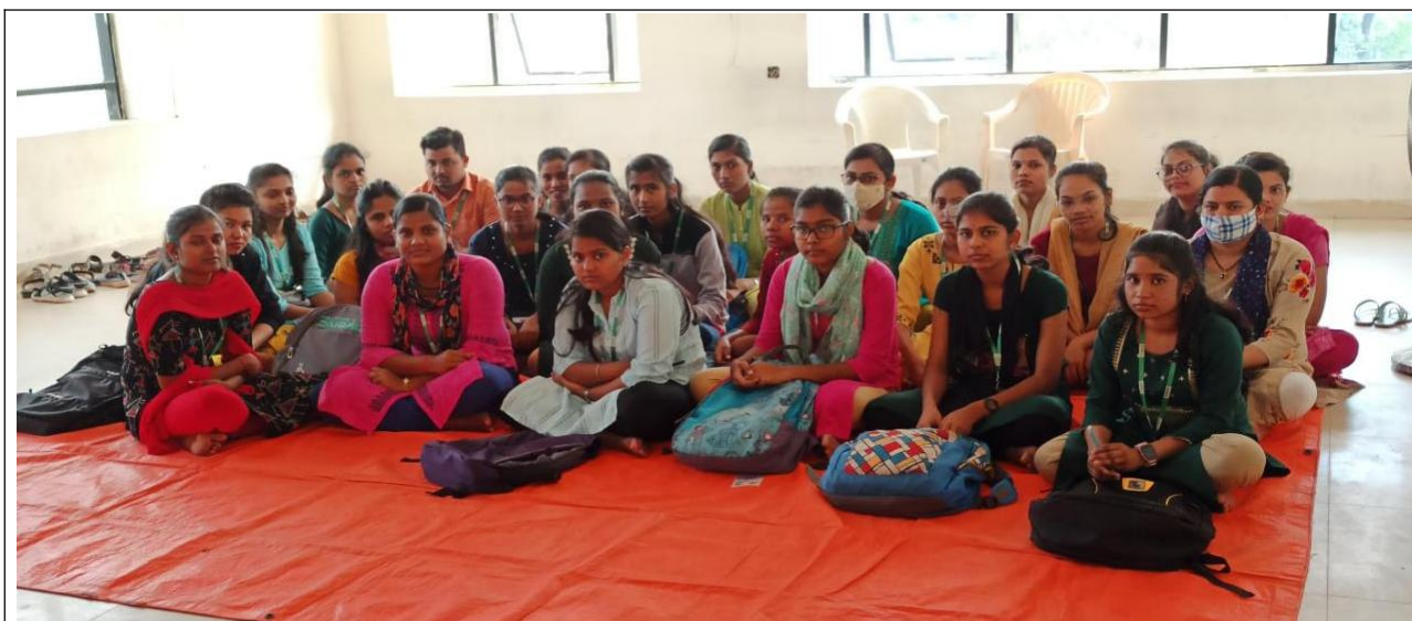
(Students waiting for the GNM scholarship selection process)