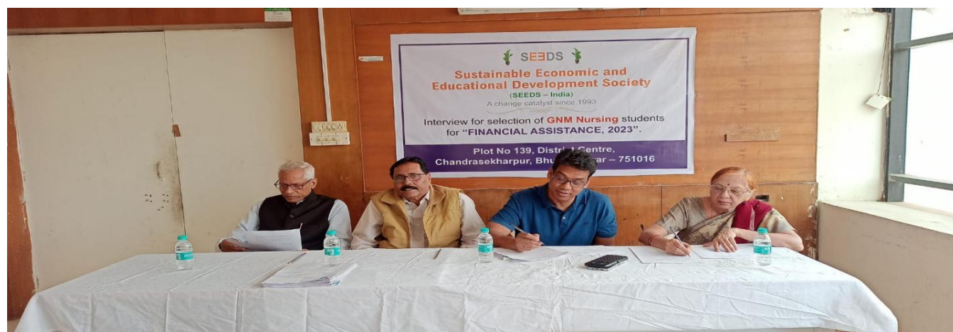
(Panelist for GNM scholarship selection)